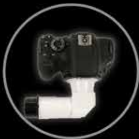
DSLR CAMERA ADAPTER