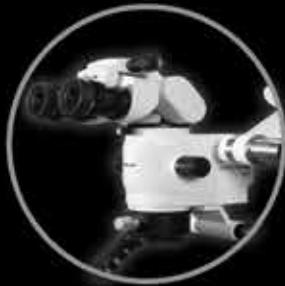
0-220° BINOCULAR HEAD