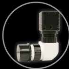
HD LIVE VIDEO CAMERA