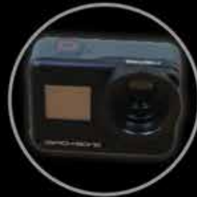
GO PRO HERO