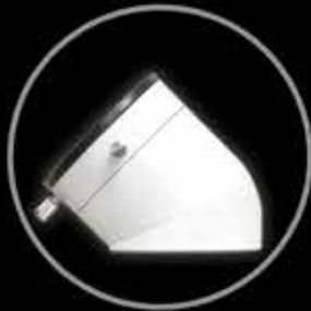
EXTENDER ROTATION DEVICE