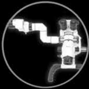
ASSISTANT TEACHING HEAD